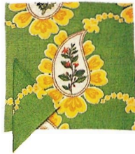
▲ Raoul Textiles "Bombay" in sprout; from AM Collections Ltd.; 100% linen; 54" w.