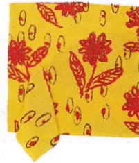
▼ Lucretia Moroni Ltd. for Fatto a Mano "Amercanda" in red on yellow (#P392/5); from Ellen Ford Ltd.; 100% linen; 50" w.; and solid linen in curry light (#2660); 100% linen; 52" w.