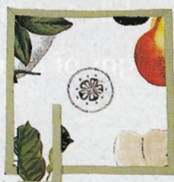
▼ Gaston y Daniela (#79456.00/376); from Brunswick & Fils; 100% cotton; 58" w.

Amusing patterns will set the mood and spark the conversation