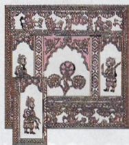
▼ China Seas "Sultan" in lilac/ecru (#898-40); from Quadrille; 70% linen, 30% cotton; 59" w.