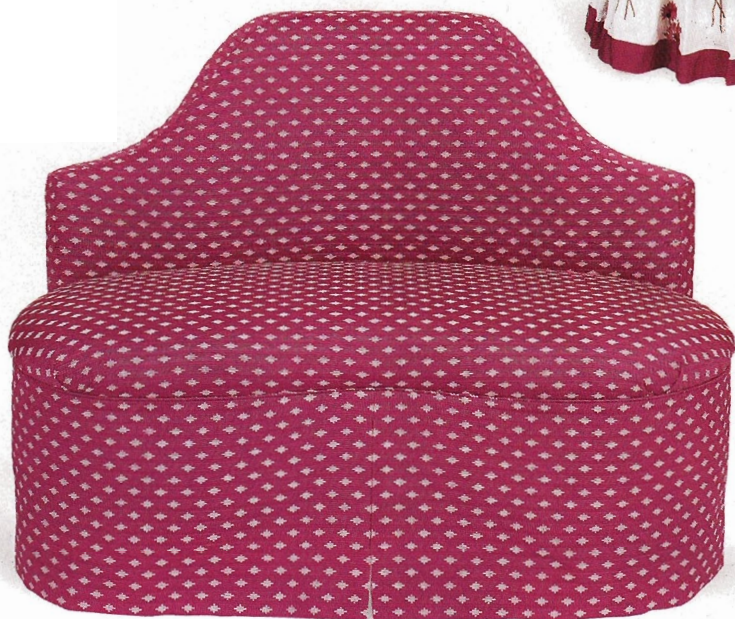
▶ Scalamandré “Bermuda Cloth” in magenta and white (#20252-008); 100% cotton; 55”w.