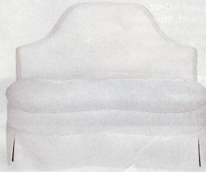
Dennis Kidney Loveseat (#71050.08) from Brunswick & Fils; 50"w. x 33"d. x 36"h.