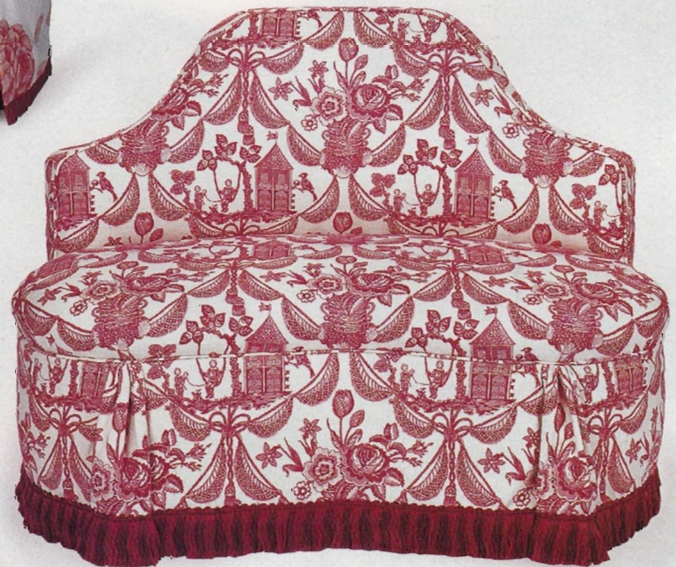
◀ Osborne & Little "Wastra Blossom" (#F966/05) from Designers Guild; 100% cotton; 53"w.