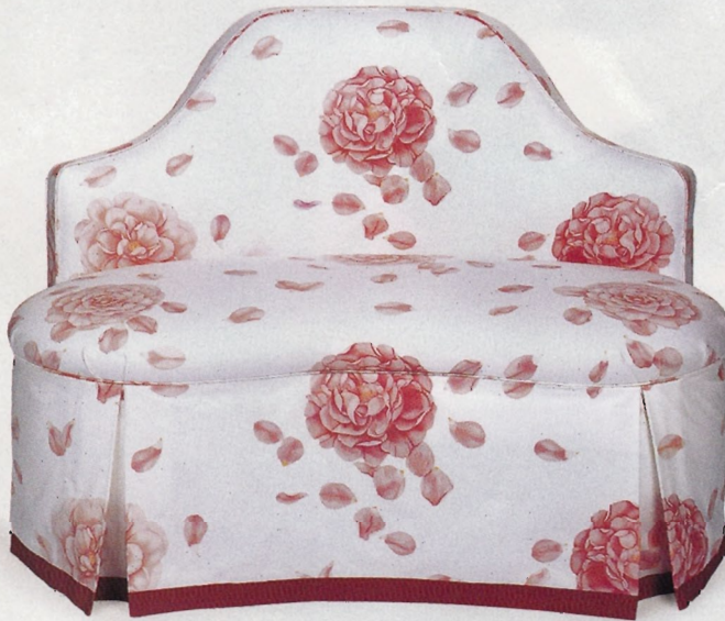
◀ Osborne & Little "Nanzen" (#LF4107/02) from Liberty's Shima collection; 100% cotton; 55"w.