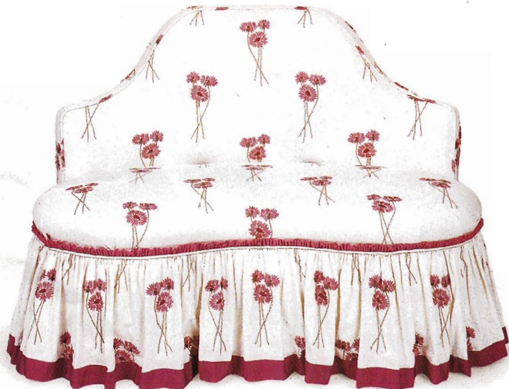
▶ Carleton V “Bachelor Button” (#P132-6); 100% cotton; 54½”w.